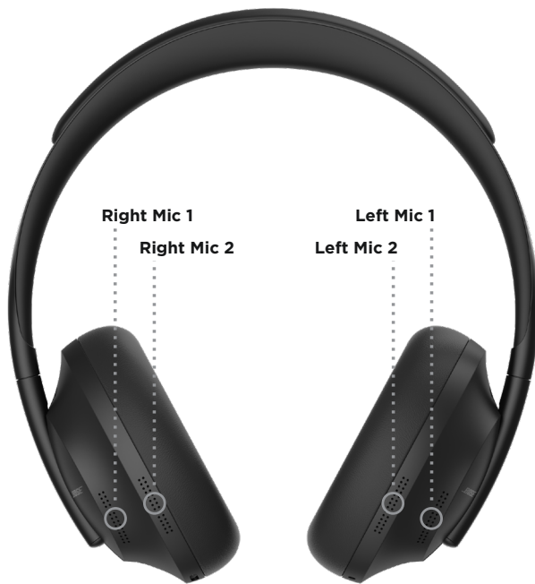
Dual beamforming voice microphone array

Speak confidently and be heard clearly on conference calls — an adaptive four-microphone system isolates your voice from surrounding noise, eliminating the mute/unmute shuffle and “... are you there?” struggle